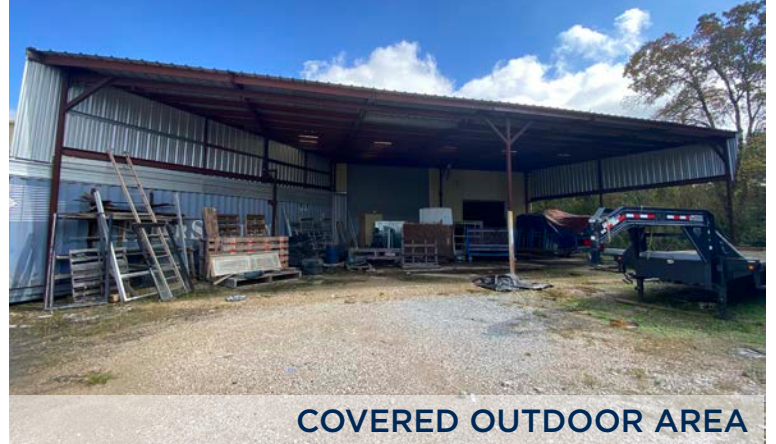
COVERED OUTDOOR AREA